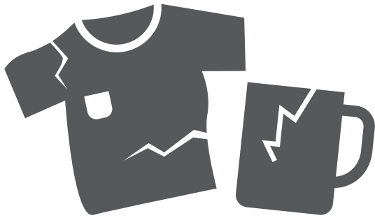
Damaged items (clothing and ceramics)