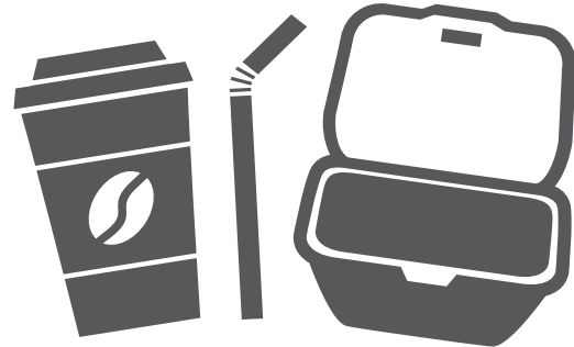
Packaging (including polystyrene)